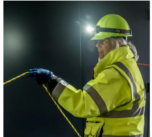
Bang! Bang! "If you can hear my voice, come to me." (A loud rubber hammer saves one's knuckles.)